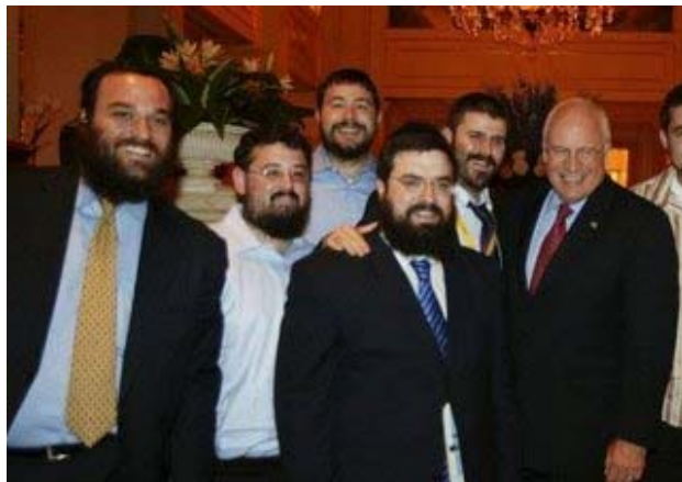
Vice President Dick Cheney ...